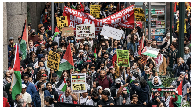
Demonstrators march in support of the Palestinian people on October 8, 2023, in New York City.