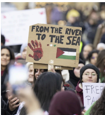
stration, in Frankfurt, Germany, Friday, Nov. 3, 2023. The Jordan River is a winding, 200-plus-mile glittering Mediterranean to its west. But a phrase about the space-in-between, "from the river Jews and pro-Palestinian activists in the aftermath of Hamas' murderous rampage zza.