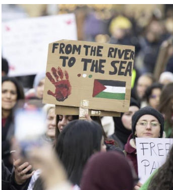
stration, in Frankfurt, Germany, Friday, Nov. 3, 2023. The Jordan River is a winding, 200-plus-mile glittering Mediterranean to its west. But a phrase about the space in-between, "from the river to the sea," has become a rallying cry for pro-Palestinian activists in the aftermath of Hamas' murderous rampage in Gaza.