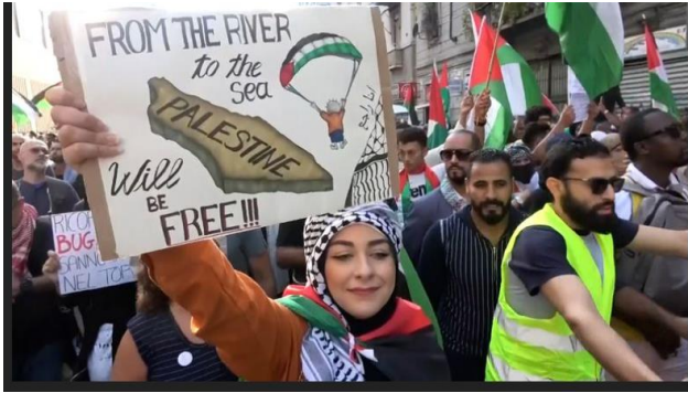
Downing Street condemns 'from river to the sea' projection on Big Ben, February 23, 2024, SKY UK NEWS