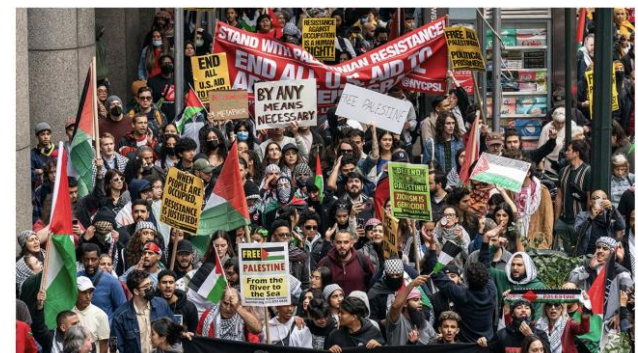
Demonstrators march in support of the Palestinian people on October 8, 2023, in New York City.